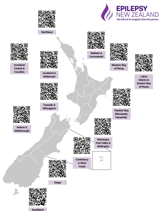
Scan QR code for Regional Educator's Business Card

I would like to take this opportunity to thank Epilepsy New Zealand very much for the ongoing support we receive.